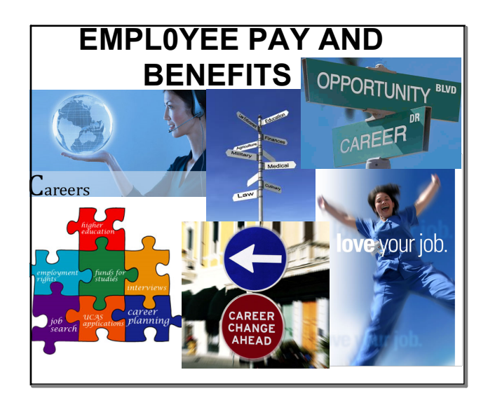
Paychecks & Benefits Unit