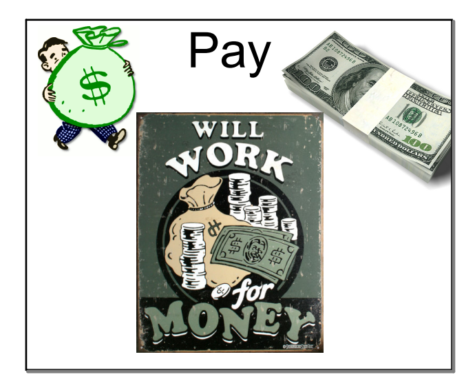
How do we pick?